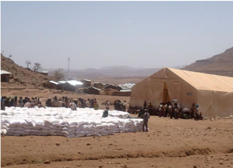
Food aid distribution site of PSNP in the Wegera woreda, North Gondar

As a result of the additional time taken to complete their work, interviewees with young children explained how they had considerably less time to spend caring for them than before the onset of the drought. The only time that they really had to care for their children – including breast feeding – was in the early afternoon and then again in the evening.